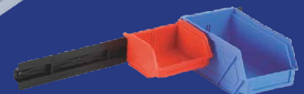
Bin Holder – 400mm plastic – 1200mm steel